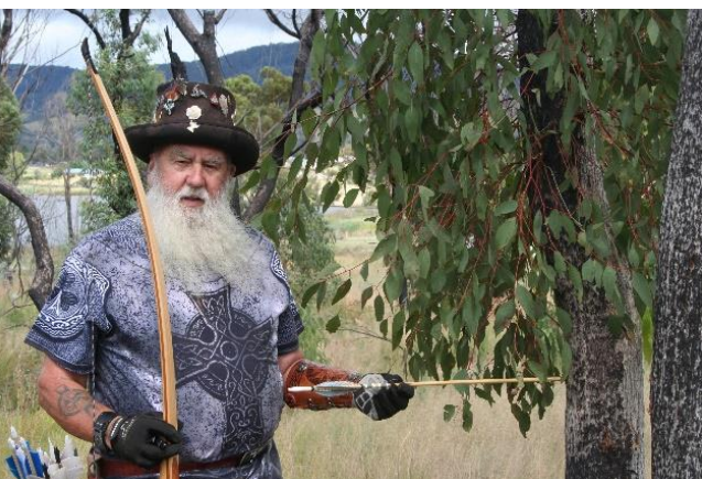
Well known archer Roadie showing us all that hitting trees and bull's eyes takes the same amount of practise.